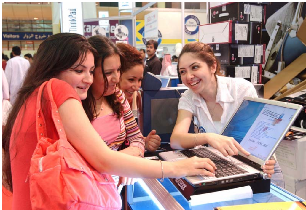
The Ultimate Shopping Experience