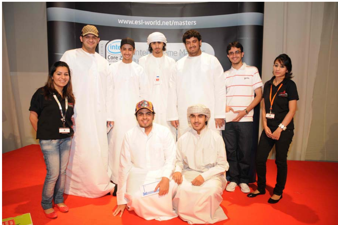
Winners of “GITEX Digital Game World Regional Championship”

GITEX Digital Game World was the biggest eGaming platform to be introduced in the Middle East at GITEX Shopper 2008. Over 4000 sqm of floor space was dedicated to a combination of various gaming activities including online PC Gaming a console based gaming area, new game launches, live entertainment and interactive promotional stands. This event also hosted the GITEX Digital Game World Championship which brought in 20 regional teams who competed for prizes worth AED 20,000.