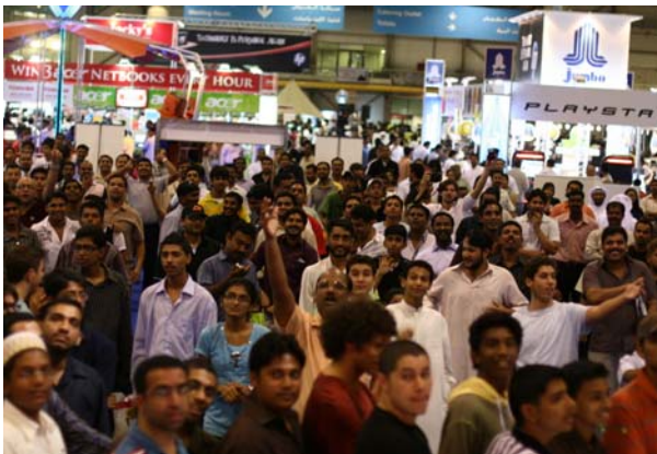
CROWDS AT GITEX DIGITAL GAME WORLD

Visitors also got the feel F1 racing in the INTEL Racing Tour that presented a fleet of INTEL F1 cars flown in exclusively for this mega event.