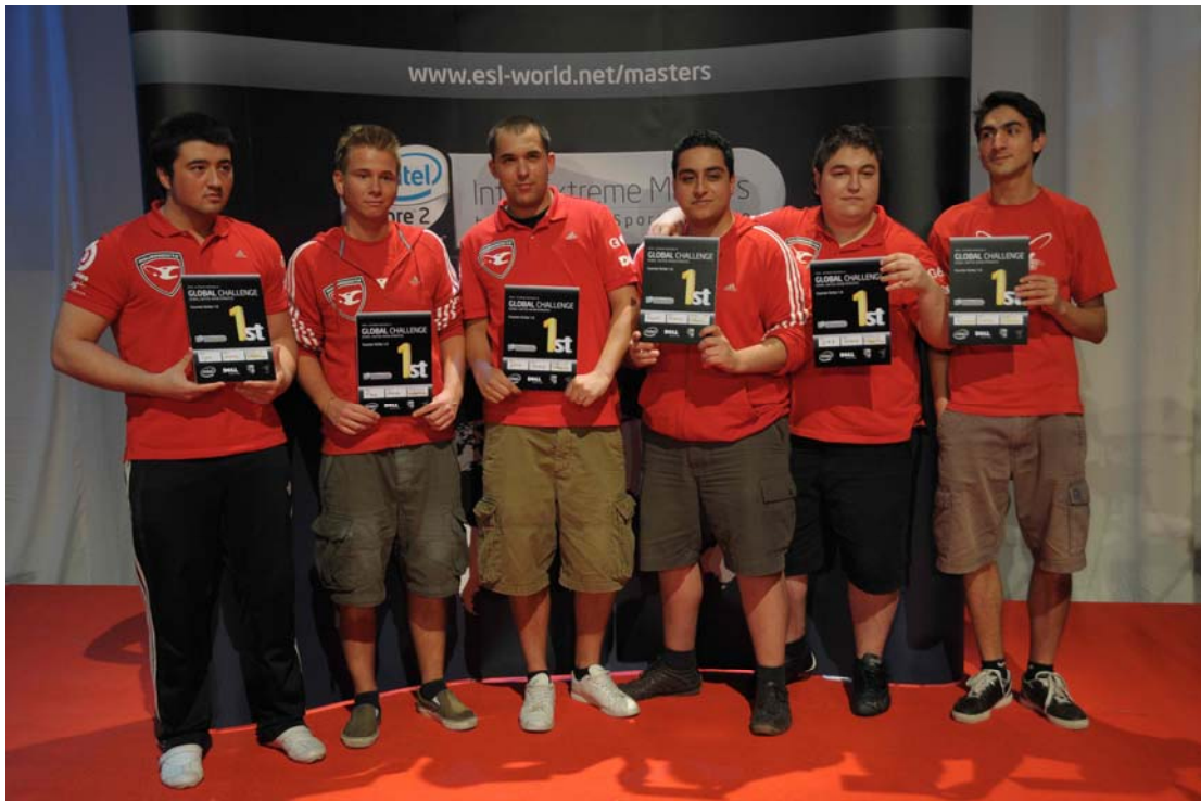
Team MOUSE SPORTS - Winners of "INTEL EXTREME MASTERS III GLOBAL CHALLENGE"