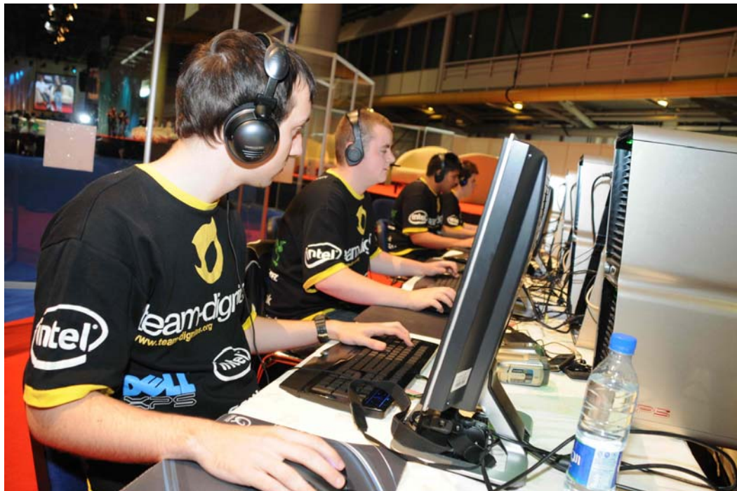
Participants at "INTEL EXTREME MASTERS III GLOBAL CHALLENGE"