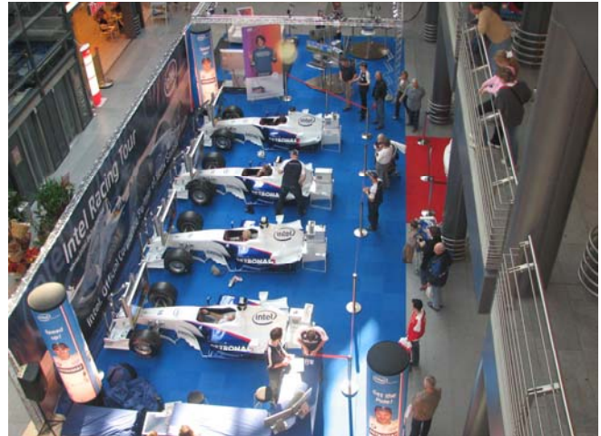
"INTEL F1 CARS"