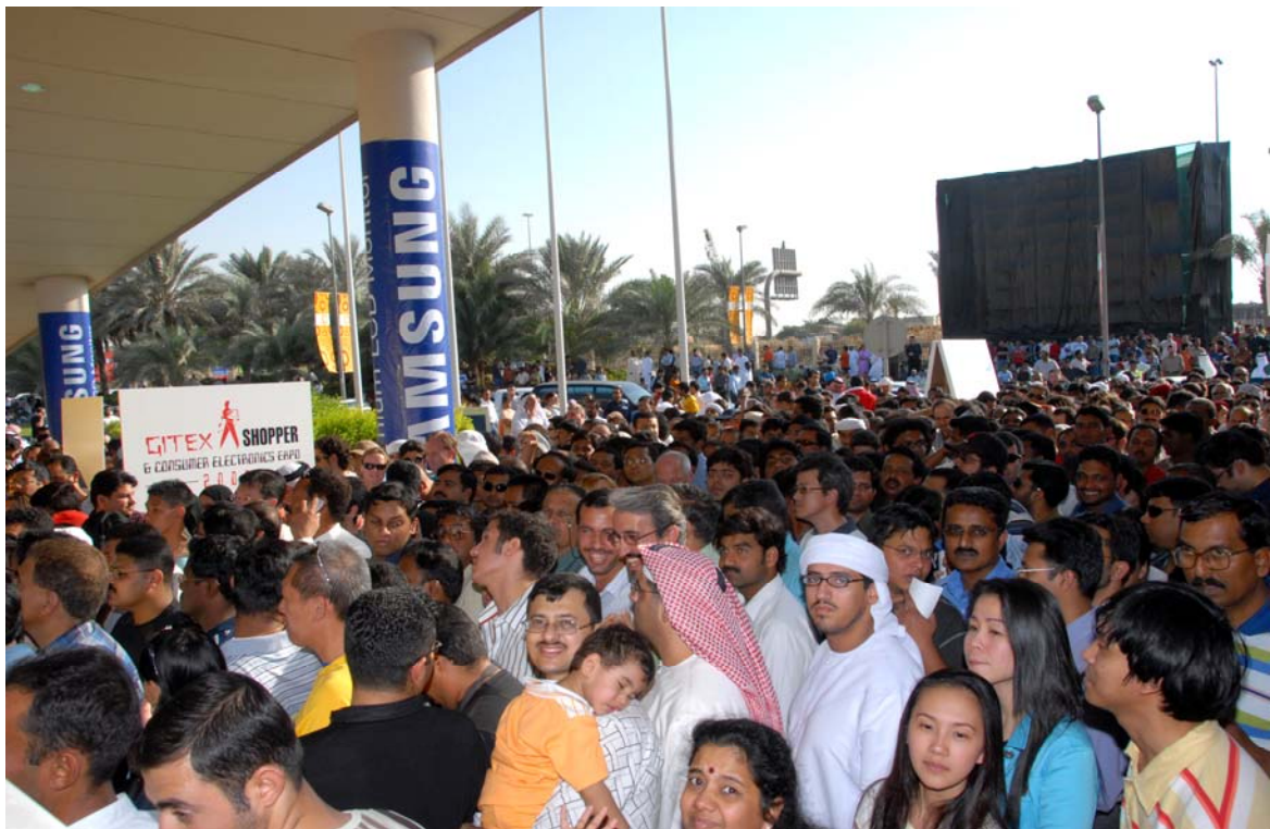
Crowds outside the Shopper

This edition saw a greater focus on the growing Gaming Industry with the launch of the “GITEX DIGITAL GAME WORLD”. An event created to whet the appetite of the increasingly demanding and knowledgeable Gaming Community in the Middle East.