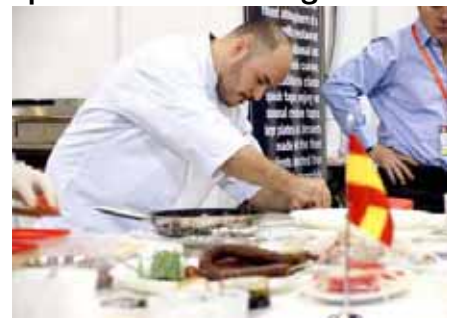
Spanish Food: Cooking Demo