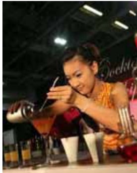
Asian Cocktail Championship