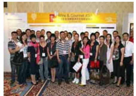
Hosted Buyer Program