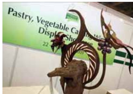
Macau Culinary Alliance Winning Showpiece Display Competition