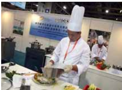
MORS Gold Pin Competition