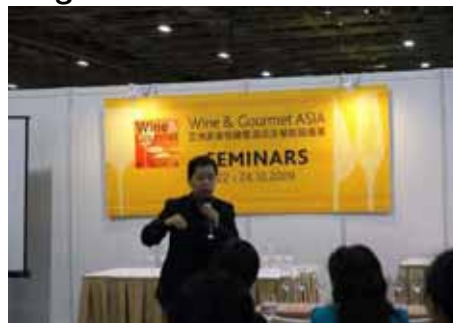
Aragon Exterior Wine Seminar