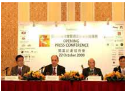
Opening Press Conference