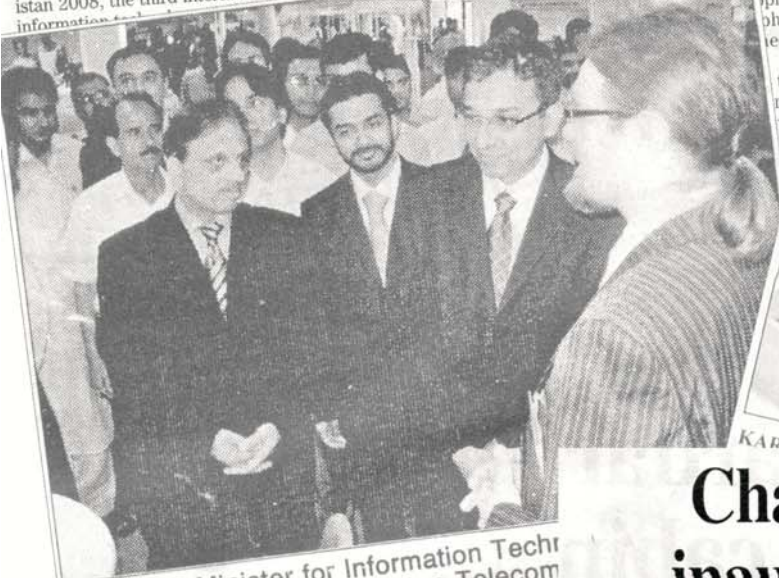
Provincial Minister for Information Technology along with Chairman Pakistan Telecommunication Authority (PTA), Shahzada Alam interacts with a foreign representative at the inauguration of Connect Asia 2008 Exhibition.

The Conference featured CIOs, CSOs, CMOs and CEOs of the corporate sector in Pakistan and was inaugurated