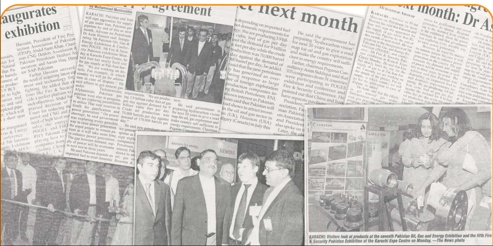
KARACHI: Visitors look at products at the seventh Pakistan Oil, Gas and Energy Exhibition and the fifth Fire & Security Pakistan Exhibition at the Karachi Expo Centre on Monday.